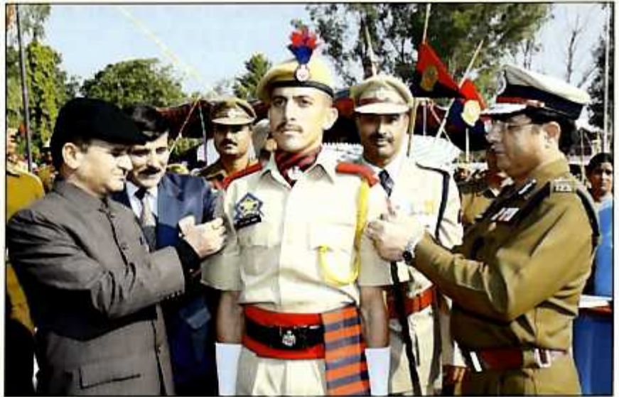
Shri Tara Chand Hon'ble Dy. CM J&K and DGP J&K pinning ranks to all round best cadet who was given one rank out of turn promotion during Attestation-cum-Passing out parade at PTS Kathua on December 01, 2010

A brochure containing detailed information with colour pictures highlighting the activities during training of the said batch was also released on the occasion.