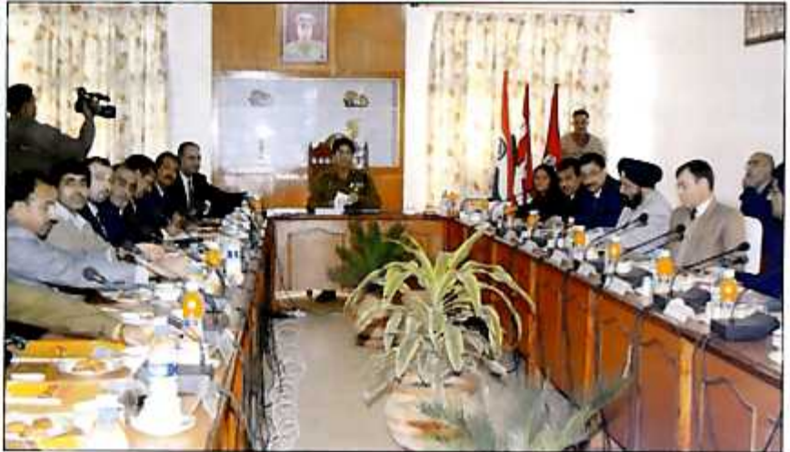
A view of review meeting of Security Wing held at Security Hqrs. J&K Jammu on December 10, 2010

While addressing this State level Security review meeting, the DGP asked the participants to adhere to the guidelines laid down with regard to security mechanism. He said that the present scenario demands more vigilance of the security personnel as the miscreants have changed their strategy. "we have to remain more vigilant to strengthen the security system in the State with no room for complacency, the DGP added.