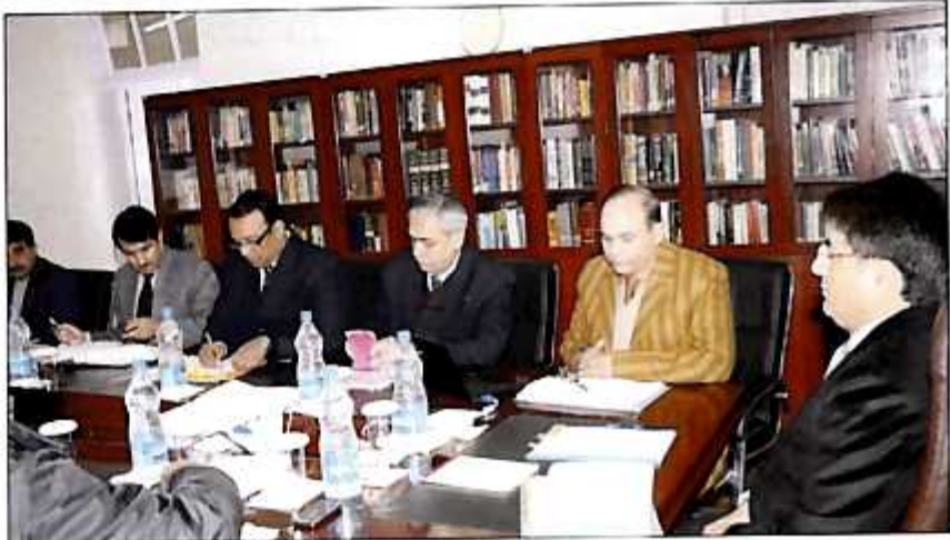
A view of review meeting of Crime Wing of J&K Police held at Crime Hqrs. Jammu on December 18, 2010

While addressing the meeting, the DGP asked the officers of the traffic wing to utilize the latest technology for regulating traffic and minimizing jamming on busy roads and coordinate with all other concerned agencies connected with the road management etc. to ensure smooth and jam free traffic movements on the roads. He disclosed that a Traffic Website dedicated exclusively to traffic issues would be launched soon and appealed people particularly youngsters to come forward with suggestions and feed back. DGP asked the officers to launch a massive awareness campaign across the state