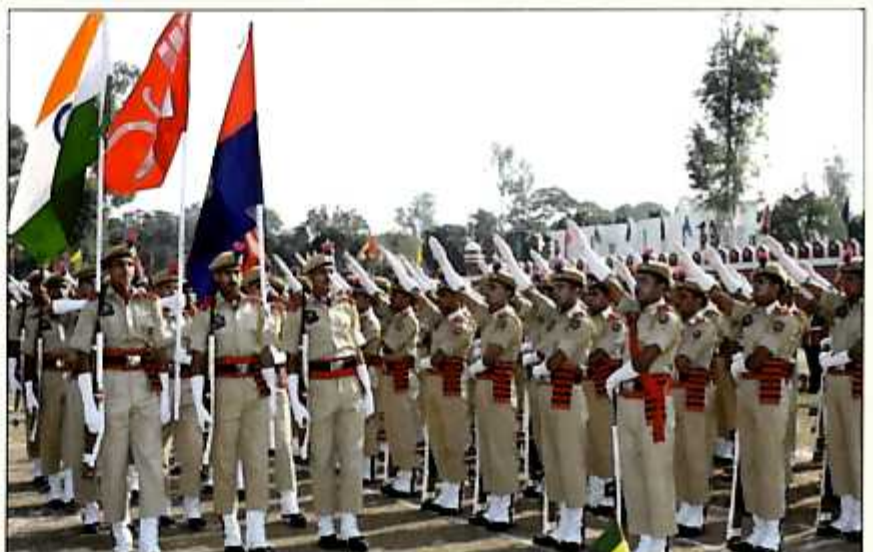
View of the Oath ceremony at PTS Kathua

Meanwhile a newly constructed Upper Subordinate Quarters Block comprising of 12 quarters and a newly established computer lab in the PTS complex was inaugurated by the Dy CM J&K Advisor to Hon'ble CM J&K respectively.