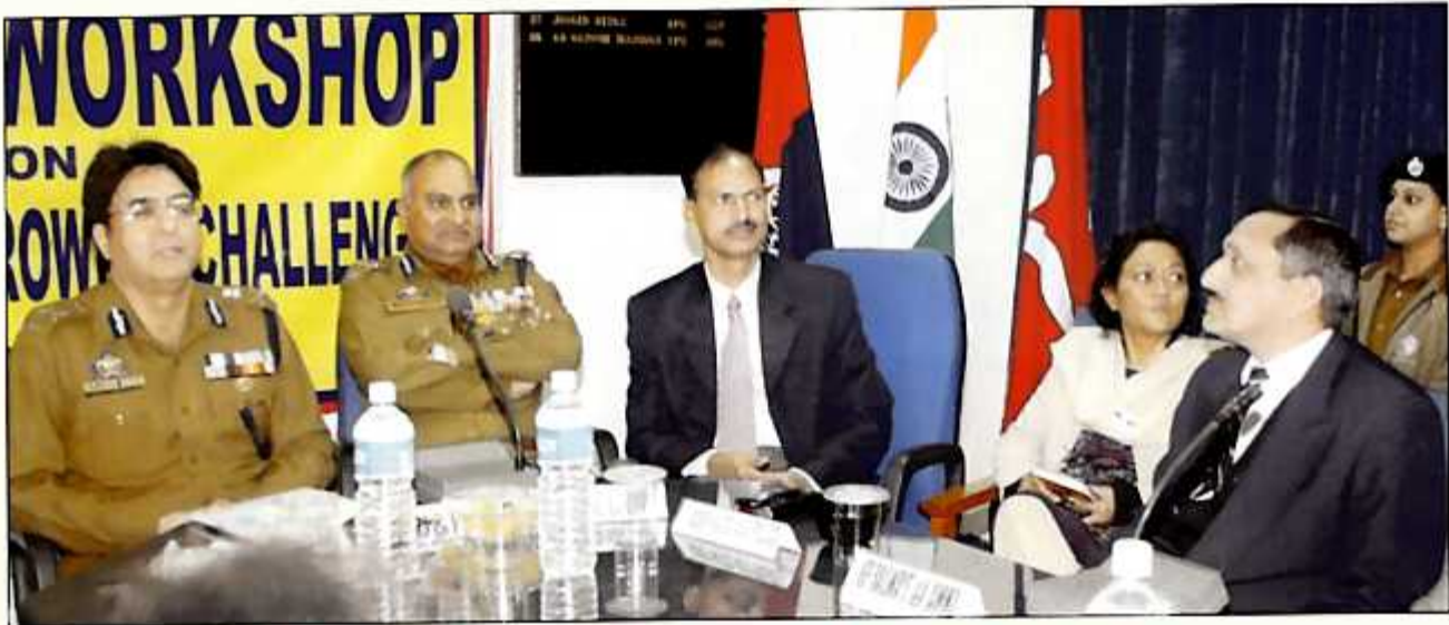
DGP J&K and other senior police officers during deliberations at the workshop