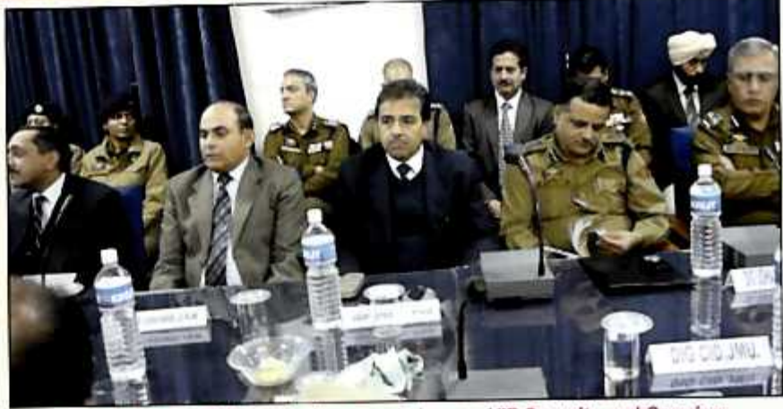
Senior Police Officers during a workshop on VIP Security and Growing Challenges at PCR Jammu on December 07, 2010

While addressing the gathering, the DGP gave detailed account of present scenario and sensitized the participants about adequate, effective and timely response. He asked the officers to shed complacency and evolve sops covering all aspects to deal with militancy in different situations. The DGP exhorted the officers to wipe out the remnants of militancy so that