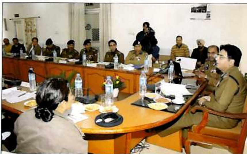
A view of review meeting of Traffic Wing of J&K Police held at Traffic Headquarters J&K Jammu on December 16, 2010