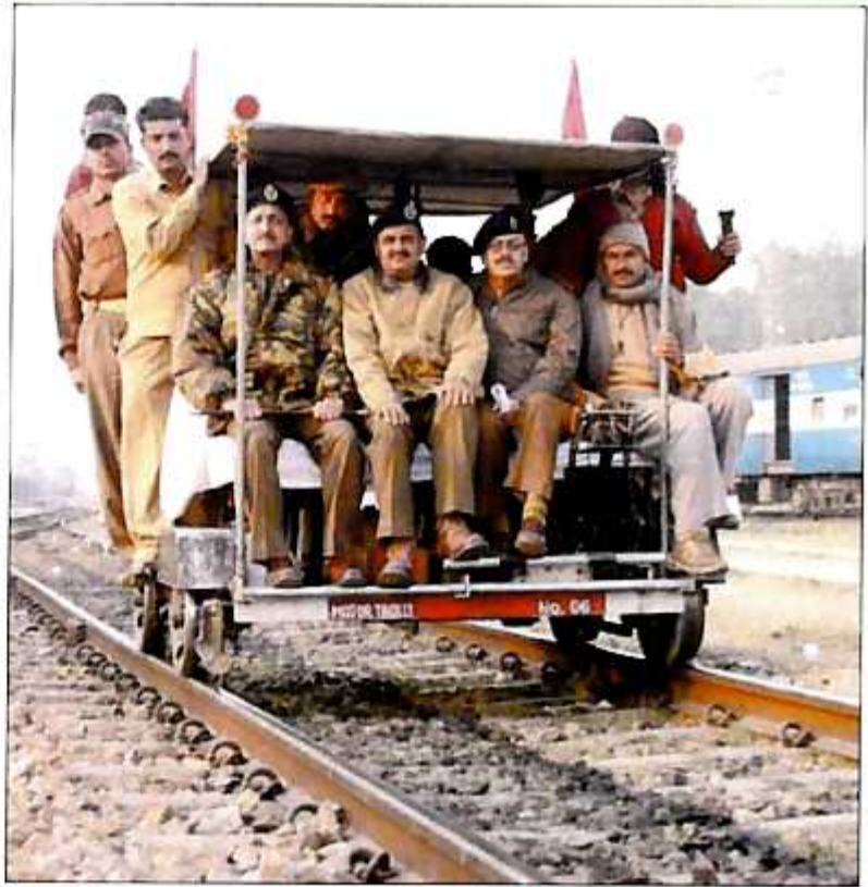
Shri Navin Agarwal IPS IGP Railways J&K inspecting Jammu-Udhampur Railways track on December 09, 2010

During the daylong inspection, the IGP held detailed interaction with the GRP personnel at all the railway stations and worked out the requirement of necessary infrastructure. He assured the cops that upgraded security related infrastructure would come up within next three to four months so that they don't face any problem in maintaining vigil particularly at the vulnerable spots like bridges and tunnels.