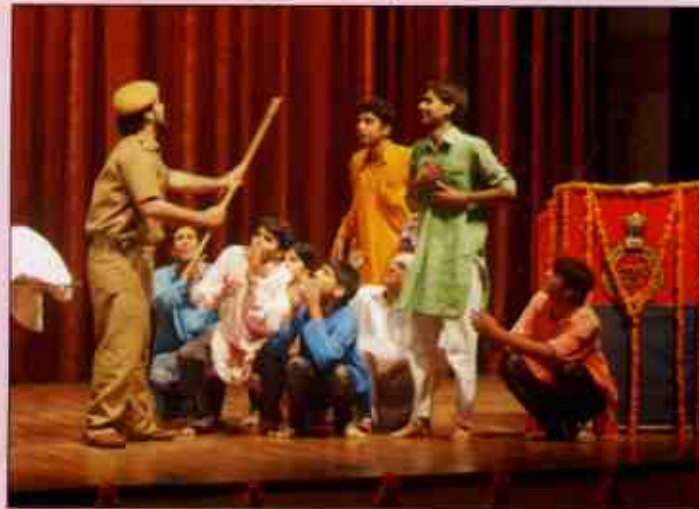
Young Artists of Natrang presenting a skit during a function held at Police Auditorium Gulshan Ground Jammu in connection with Anti Drugs & Illicit Trafficking Day on June 26, 2010

could save the society from the clutches of this social evil. He urged the youth to shun the way of drugs and start a constructive approach to life.