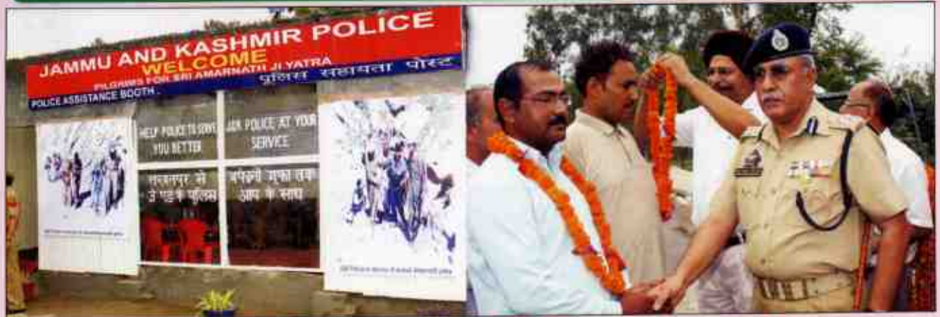
Shri Farooq Khan IPS DIG Jammu-Samba-Kathua Range during the inauguration of Assistance Booth-cum-Facilitation Centre for Shri Amar Nath Ji Yatris at Lakhanpur on June 29, 2010

Shri Farooq Khan IPS DIG Jammu-Kathua Range inaugurated the Assistance Booth-cum-Facilitation Centre for Shri Amarnath Yatris at Lakhanpur on June 29, 2010. While inaugurating the