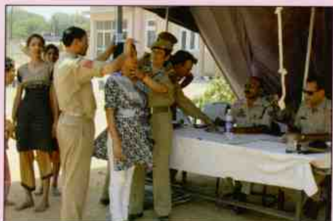
A view of the recruitment of Lady Constables in J&K Police at Gulshan Ground Jammu on June 21, 2010