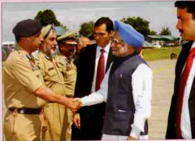
Shri Manmohan Singh Hon'ble Prime Minister of India during his arrival at the Srinagar International Airport on June 07, 2010