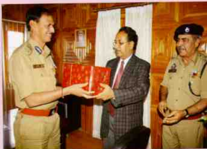
Shri Ravinder Kotwal IPS IGP Railways presenting gift to Shri S.Gopal Reddy IPS on June 03, 2010 at Srinagar