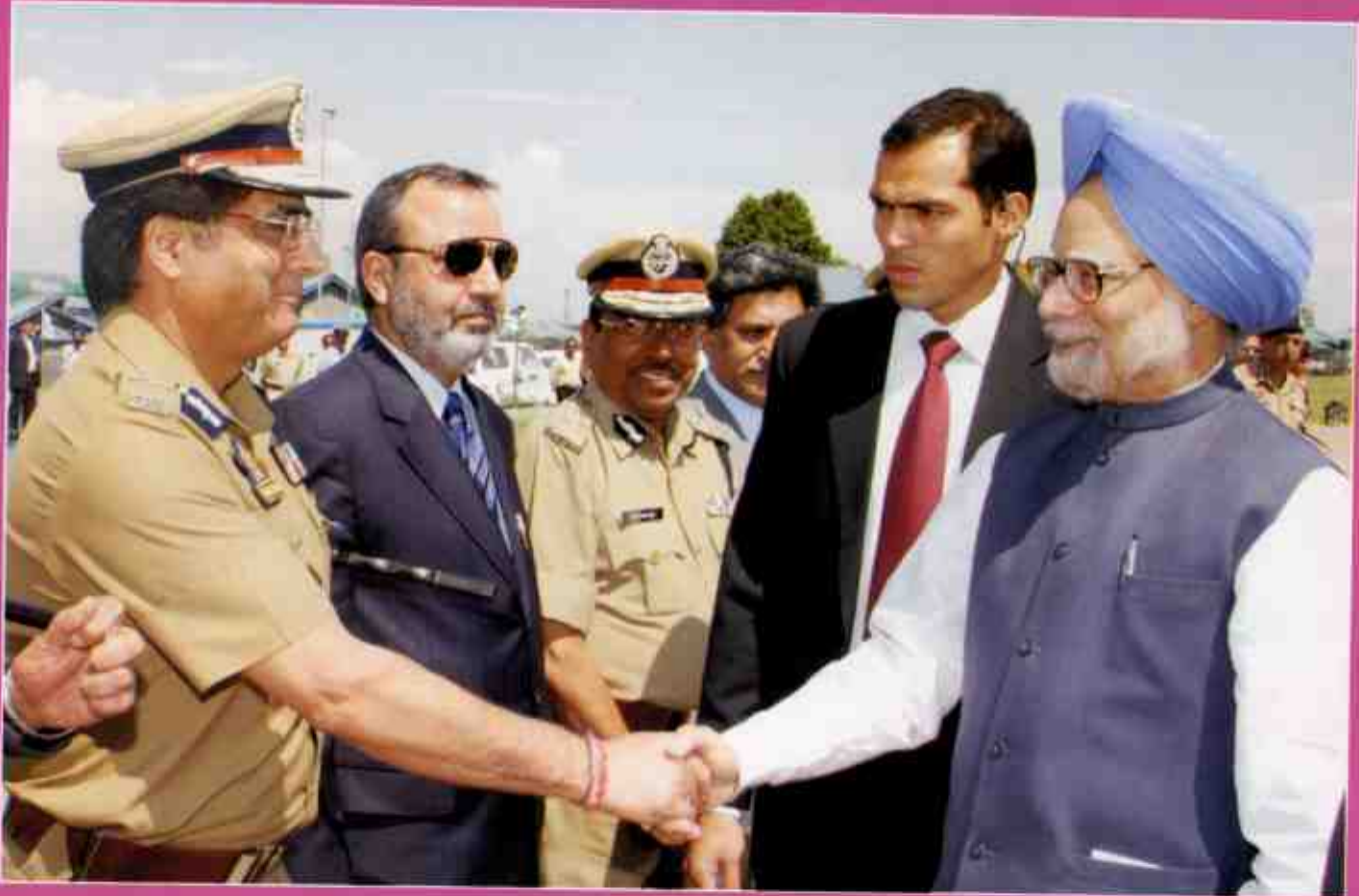
Shri Kuldeep Khoda IPS DGP J&K greeting Shri Manmohan Singh Hon'ble Prime Minister of India at Srinagar during the later's visit to Jammu & Kashmir on June 07, 2010