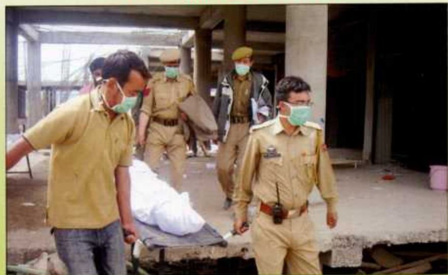
J&K Police personnel carrying out the rescue operation at Leh