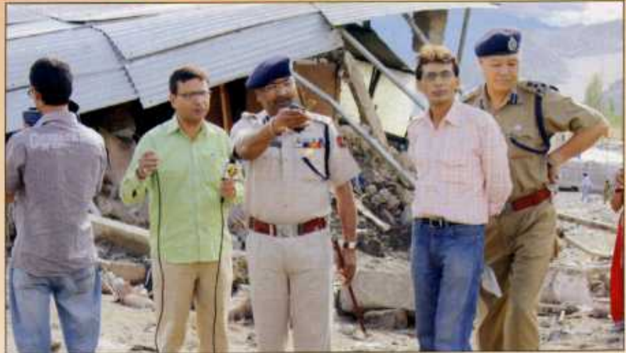
Shri Dilbag Singh IPS IGP Armed J&K and Shri T.Punchok IPS DIG AP Jammu supervising the rescue operation launched by J&K Police during colossal tragedy which struck Leh during the intervening night of August 5&6, 2010

There had been extensive damage to public utilities such as BSNL Exchange, Civil Hospital, Airport, Drinking Water supply works, National Highways connecting Leh-Manali, Leh Kargil and also the private properties.