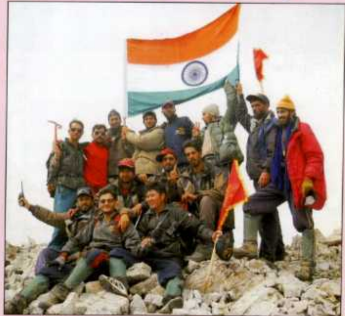
J&K Police Mountaineers flying the National Flag atop an unnamed peak in Kashmir on August 15, 2010