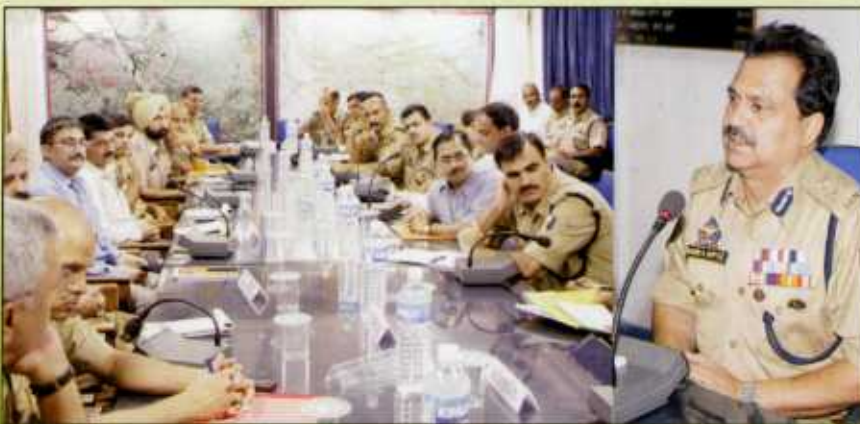
Shri Ashok Gupta IPS IGP Jammu addressing a high level meeting ahead of Independence Day 2010 at ZPHQ Jammu on August 07, 2010

The IGP Jammu asked the concerned security agencies in particular and appealed the people in general to remain vigilant and defeat the nefarious designs of the anti-social and anti-national elements.