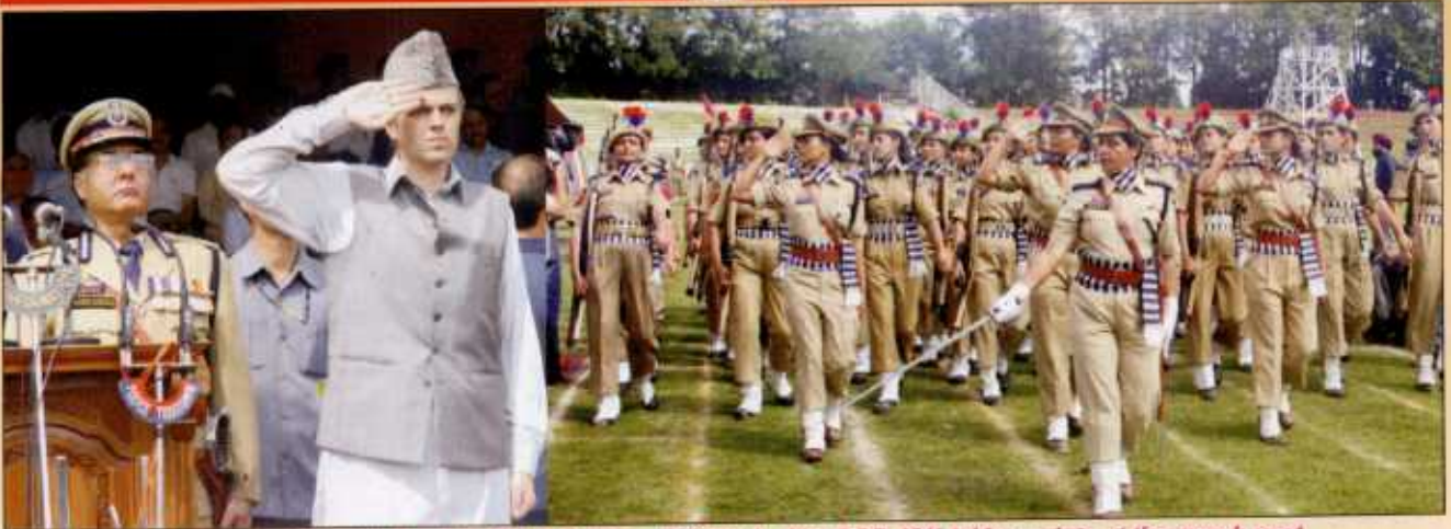
Shri Omar Abdullah Hon'ble Chief Minister J&K flanked by DGP J&K taking salute at the march past during Independence Day Parade at Bakshi Stadium, Srinagar on August 15, 2010