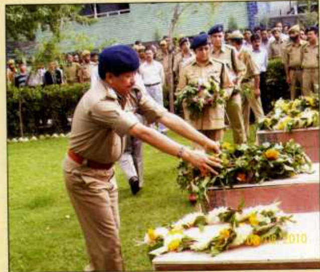
Senior police officers laying the floral wreaths on the coffins of police personnel who laid down their lives during cloud burst in Leh

On behalf of all rank and file of J&K Police, the editorial board of J&K Police Newsletter express their profound grief & heart felt condolence to the bereaved families and pray to Almighty for eternal peace to the departed souls