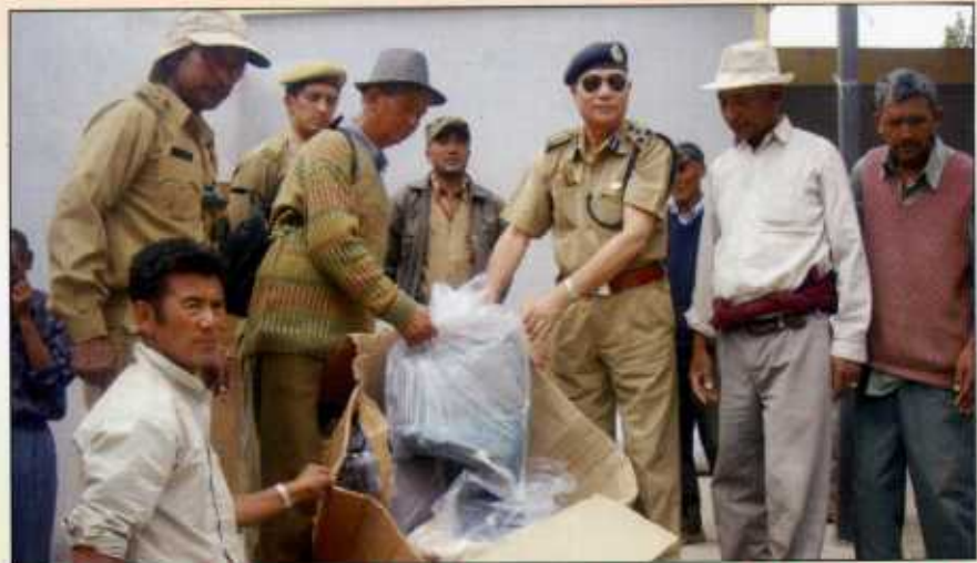
Shri T.Punchok IPS DIG Armed Jammu personally supervising the distribution of relief items among the cloud burst victims at Leh