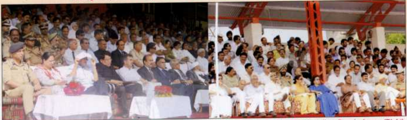
Audience witnessing the Independence Day functions at Bakshi Stadium Srinagar (Left) and Mini stadium Parade Jammu (Right)