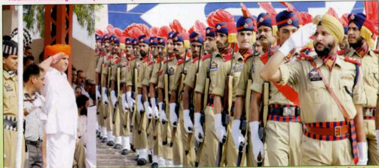
Shri Tara Chand Hon'ble Deputy Chief Minister J&K taking salute at the march past during Independence Day Parade at Mini Stadium Parade Ground Jammu on August 15, 2010