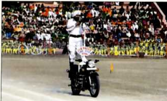
A Dare Devil of J&K Police presenting a rare stunt during Republic Day 2011 Parade at MA Stadium Jammu