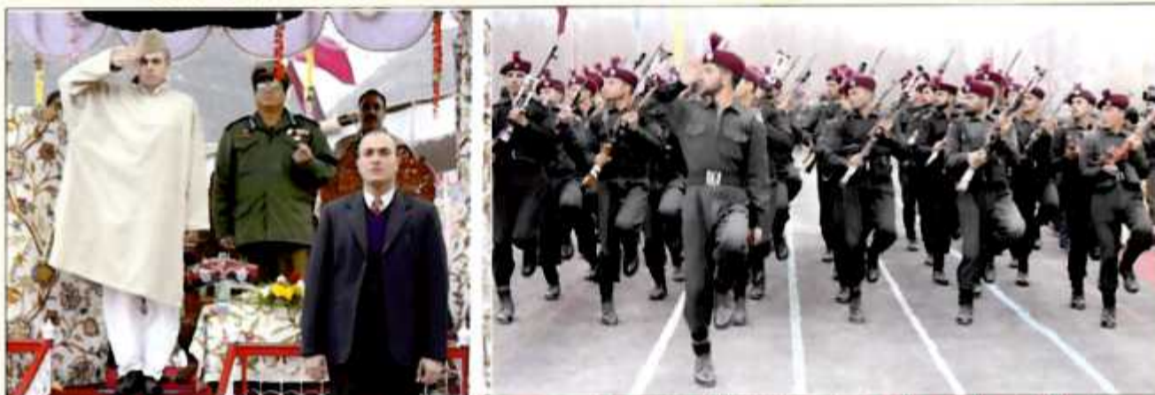
Jenab Omar Abdullah Hon'ble Chief Minister J&K accompanied by DGP J&K taking salute at the march past of trainees during passing out parade at STC Sheeri on January 13, 2011

Attestation-cum-Passing out Parade of 1173 Recruit constables was held at STC Sheeri on January 13, 2011.