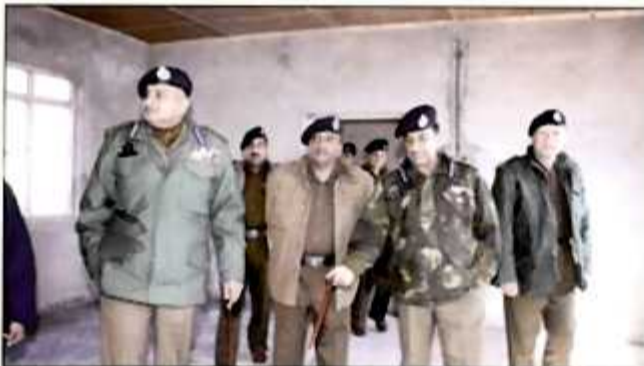
Addl. DGP Armed/ Law & Order J&K inspecting a newly constructed police building at Doda