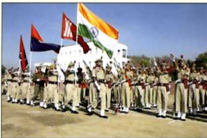
R/Cts of PTTI Vijaypur being administered the oath of allegiance during Passing out parade on January 22, 2011