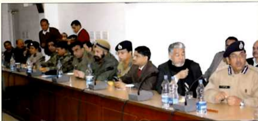
Senior Police Officers witnessing the launch of Traffic Police Website during its inauguration by DGP J&K at PHQ J&K Jammu on January 06, 2011