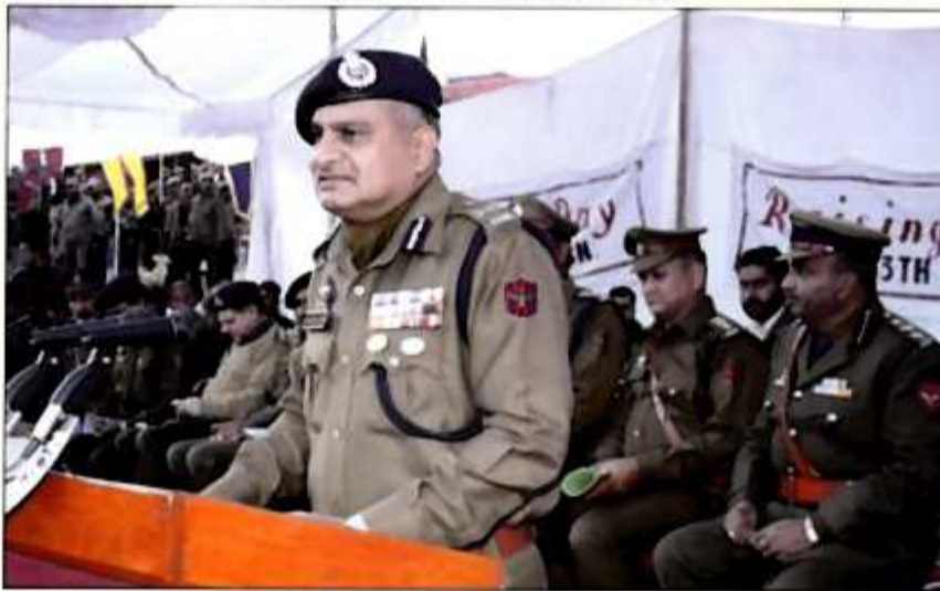
Addl. DGP Armed/ Law & Order J&K addressing the gathering during the inauguration of Raising Day Function of JKAP 13 th Bn. at Doda