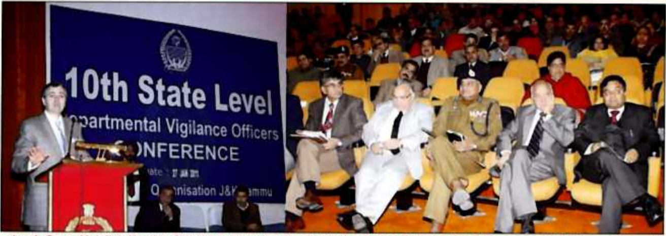
Jenab Omar Abdullah Hon'ble CM J&K addressing the dignitaries during 10 th State Level Departmental Vigilance Officers' Conference at Police Auditorium Gulshan Ground Jammu on January 27, 2011