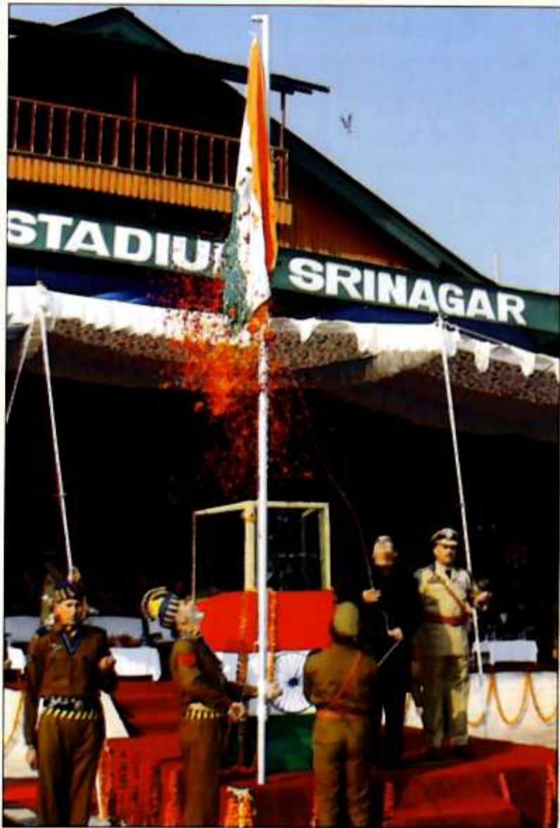
Shri Abdul Rahim Rather Hon'ble Finance Minister J&K unfurling the National flag on the occasion of 62nd Republic Day function at Bakshi Stadium Srinagar on January 26, 2011

Shri Abdul Rahim Rather Hon'ble Finance Minister J&K unfurled the National tricolour at Bakshi Stadium Srinagar. Contingents of various wings of J&K Police and Paramilitary forces and school children of various Srinagar based schools participated in the march past.