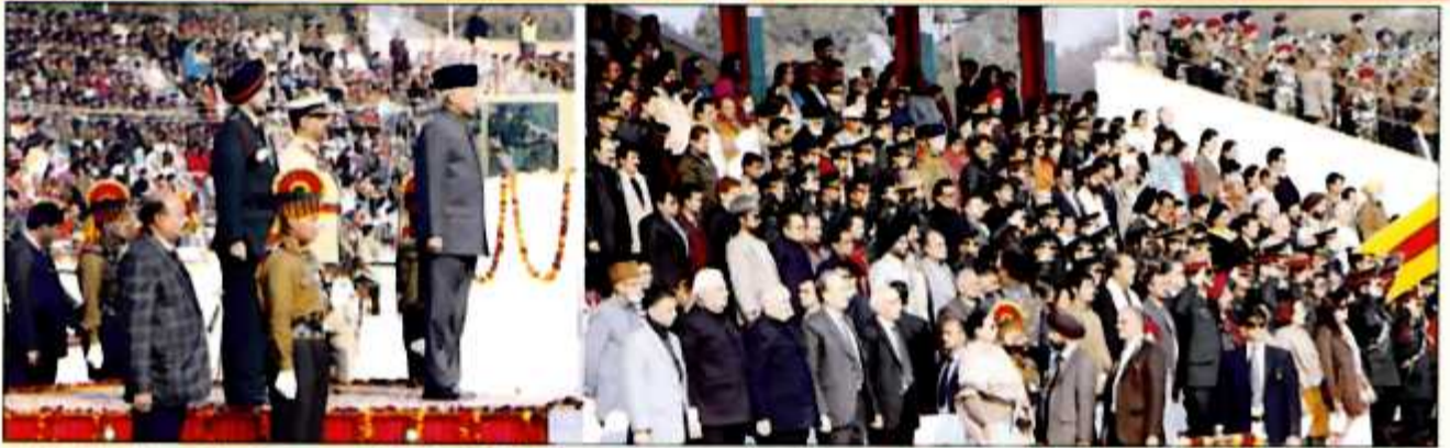
His Excellency the Governor J&K Shri N.N Vohra and dignitaries amongst the gathering paying obeisance to the National Anthem during Republic Day function on January 26, 2011 at MA Stadium Jammu