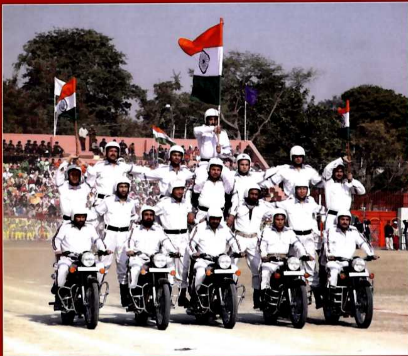
Dare Devils of J&K Police holding national flag marching through the Republic Day 2011 Parade at MA Stadium Jammu