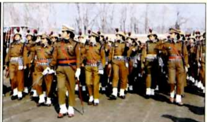
A view of the march past of the J&K Police women contingent during Republic Day parade at Bakshi Stadium Srinagar on January 26, 2011