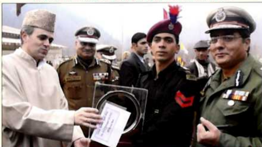
Hon'ble CM J&K flanked by DGP J&K and ADGP Armed/Law & Order J&K presenting a memento to all round best trainee of the batch during passing out parade at STC Sheeri Baramulla