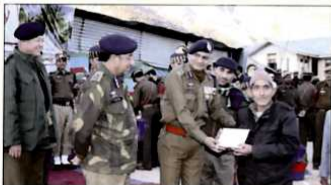
Above & Below:- Chief Guest presenting gifts to retired Police personnel of JKAP 13 th Bn. during Raising Day function of the unit on January 05, 2011