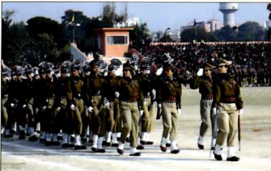
A view of the march past of the J&K Police women contingent during Republic Day parade at M.A Stadium Jammu on January 26, 2011

Hon'ble Finance Minister addressed the gathering comprising of Hon'ble Ministers, senior Civil/Police Officers and cross section of people.