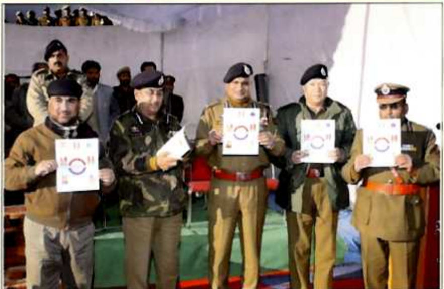
Addl. DGP Armed/ Law & Order J&K (3 rd from right) accompanied by senior civil/ police officers releasing the booklet on 22nd Raising Day of JKAP 13th Bn. at Nagri, Doda on January 05, 2011

While addressing the function, the ADGP Stressed upon the personnel to be people friendly, uphold the dignity and honour of police and work with full