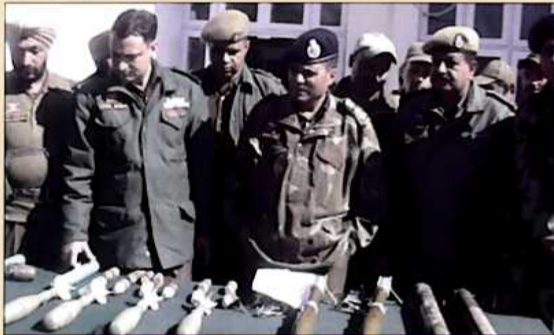
Senior Police Officers inspecting the Arms and Ammunition recovered by J&K Police at Poonch

During the month of January 2011, J&K Police apprehended 03 militants, 07 OGWs besides recovery of a huge quantity of arms and ammunition during various operations conducted across the State. The recovery includes 05 AK 47 rifles, 16 AK Magazines, 2824 AK rounds, 07 pistols, 06 pistol magazines, 80 pistol rounds, 120 hand grenades, 02 wireless sets, 02 Binoculars, 07 kgs explosive, 08 RPG shells, 18 UBGL rounds, 16 detonators, 01 IED box, 01 wire fuse, 425 Pika rounds, 02 solar missiles, 538 sniper rounds and 01 sniper magazine.