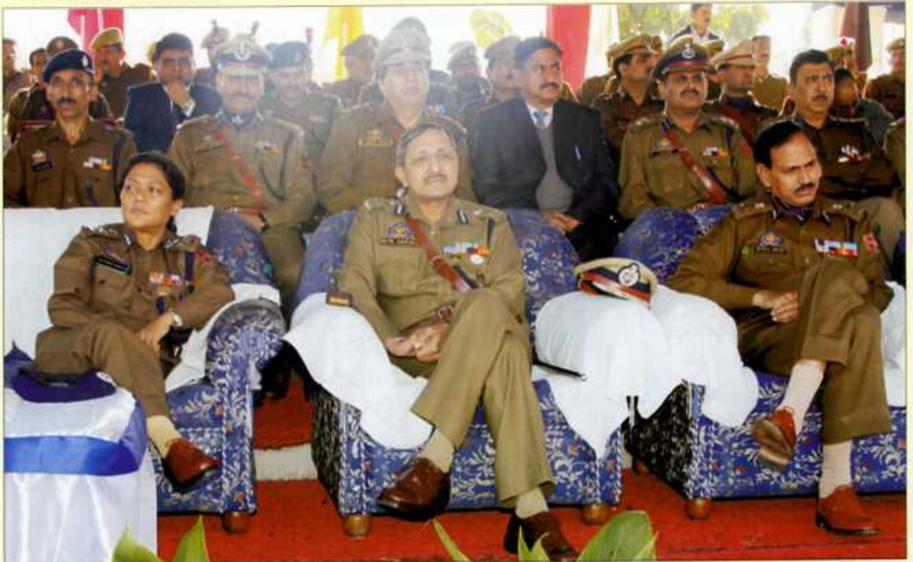
A galaxy of Senior Police Officers witnessing the Passing Out Parade function for 3rd BRTC Batch of Women Constables at SKPA Udhampur on November 27, 2010

The DGP expressed gratitude to Hon'ble Chief Minister for his keen interest in developing Jammu and Kashmir Police as one of the most professional and modern police forces in the country