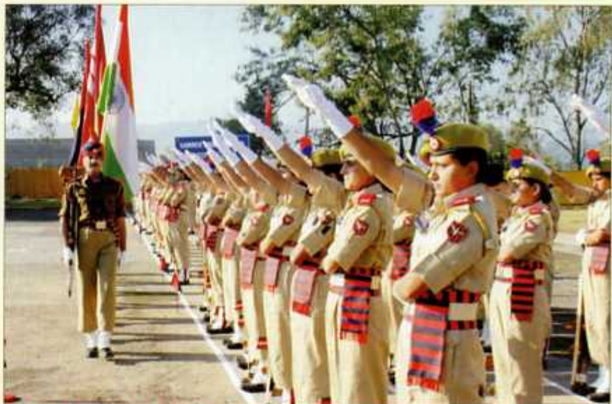
Women constables taking oath of allegiance during their passing out parade at SKPA Udhampur on November 27, 2010

Among the 168 Lady Constables who passed out after successful completion of training in all aspects of police functioning including RPC, Cr.P. C, Local & Special laws, Human Rights Management, Police Practical Work, Scientific Aid, Forensic Science,