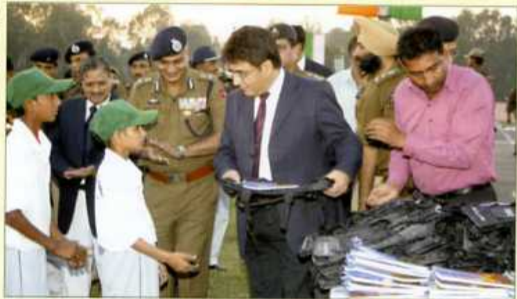
DGP J&K accompanied by ADGP Armed/Law & Order J&K and other senior police officers distributing sports dresses to the students