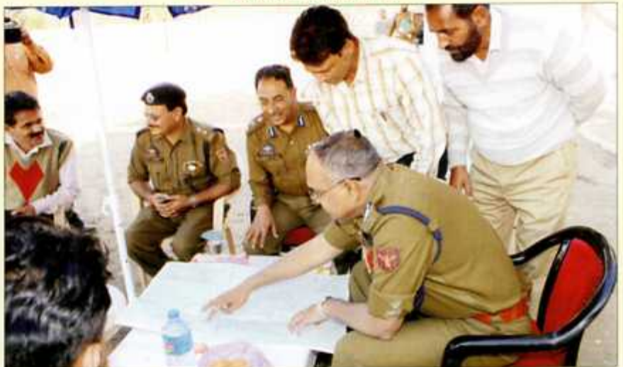
ADGP Armed/Law & Order J&K inspecting the site plan of construction of accomodation for IRP Bn. Hqrs. at Shah Balote Nud Samba on November 20, 2010