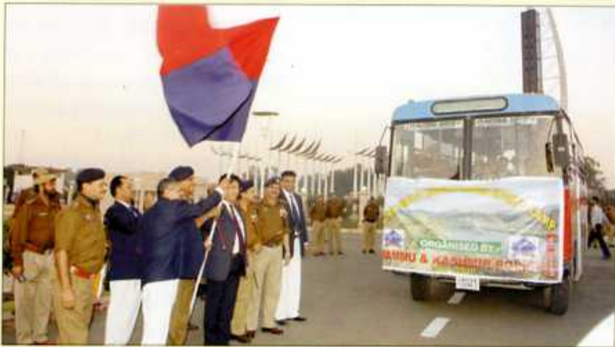
DGP J&K accompanied by Senior Police Officers flagging off the students for Adventure Sports camp on November 13, 2010 at Jammu

Mansar, Chinore and Jajjar Kotli from November 12 to 16, 2010 under the supervision of expert mountaineering team of J&K Police.