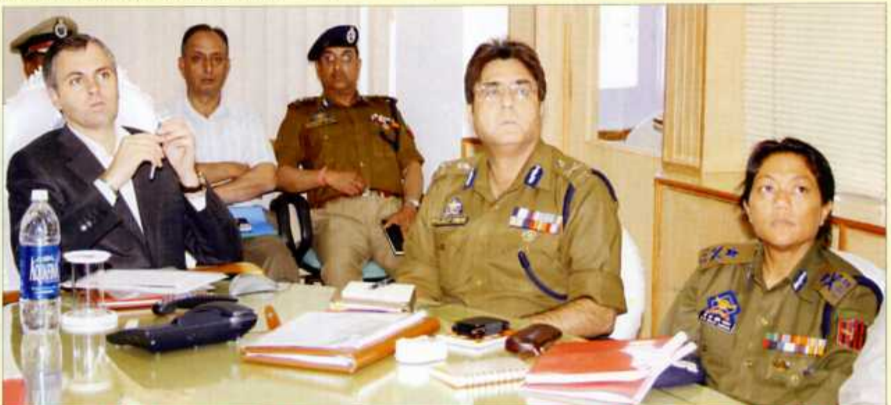
Shri Omar Abdullah Hon'ble CM J&K reviewing Law & Order situation through video Conferencing with District SSsP while addressing a high level meeting attended by senior civil/police officers at PHQ J&K Jammu on November 09, 2010