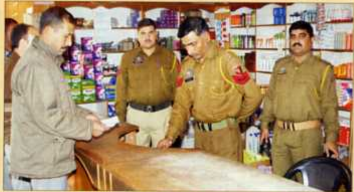
A view of cosmetic items counter of Police Departmental Store Jammu