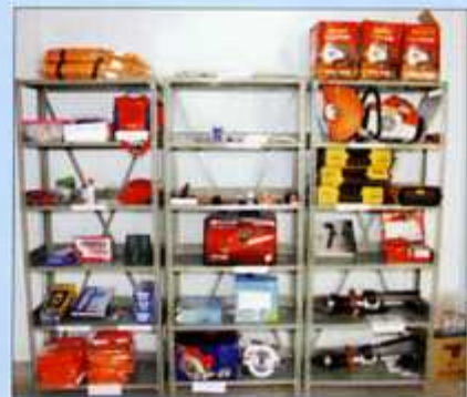
Sophisticated disaster management equipments at PTTI Vijaypur

SDRF Coys and utilization in multi-hazardous prone districts of the state. The Civil Defence Organization of J&K has so far purchased Equipments/ training material worth Rs. 30.00 Lacs for 13 multi-hazardous prone districts and provided the same to Principal PTTI Vijaypur for imparting Disaster Management training to the SDRF personnel.