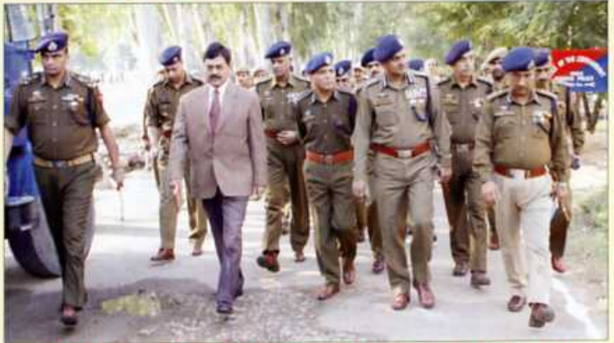
ADGP Armed/Law & Order J&K accompanied by senior police officers while conducting the inspection of Armed Police Complex Channi Himmat Jammu on November 19, 2010