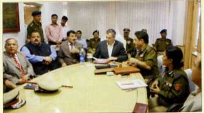
A view of video conference presided by Hon'ble CM J&K at PHQ J&K Jammu with District SSsP on November 09, 2010