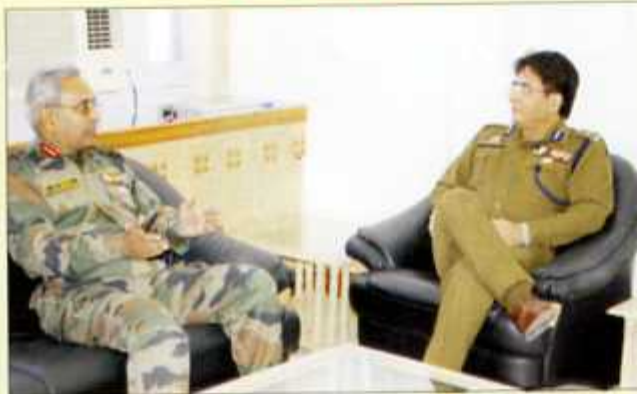
Shri R.Roy, GOC 16 Corps & DGP J&K interacting during former's visit to PHQ J&K Jammu on November 15, 2010