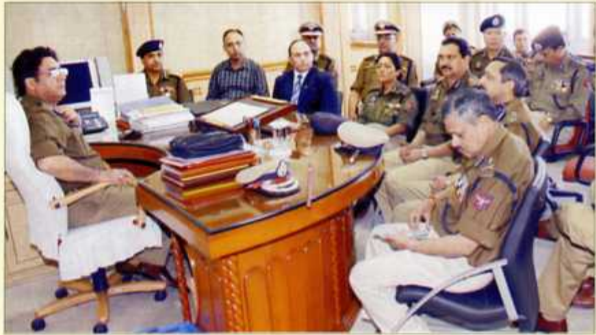
DGP J&K presiding a meeting of Senior Police Officers in his office chamber at PHQ J&K Jammu on the opening of PHQ at Jammu on November 08, 2010

The DGP accompanied by senior police officers visited various sections of PHQ, APHQ, PHC, Home guards/Aux. Police Hqrs., CID Hqrs., Crime Hqrs, Security Hqrs. and Railway Hqrs. During the visit DGP enquired about the welfare of police personnel especially accommodation facilities at Jammu and issued on spot instructions to the concerned heads for redressal of the problems of staff. The DGP also convened a meeting of senior police officers at his office chamber in PHQ and discussed various issues related to security scenario and law and order in the state.