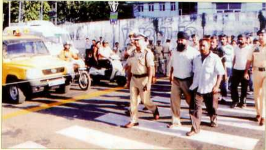
A view of the inauguration of pedestrian crossing at Bikram Chowk, Jammu by IGP Traffic J&K Shri H.K.Lohia IPS

Similarly, it has been proposed to the Government to make it mandatory (as a prerequisite to issuing of permits) for all commercial