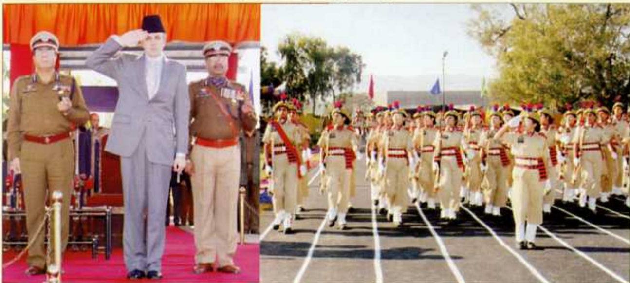
Shri Omar Abdullah Hon'ble CM J&K taking the salute at the march past of 3rd BRTC batch of Women constables during their attestation-cum-passing out parade at SKPA Udhampur on November 27, 2010

While highlighting the role of women police as pivotal in extending service to the women population in the state to safeguard and protect their rights, Hon'ble Chief Minister said women in police are