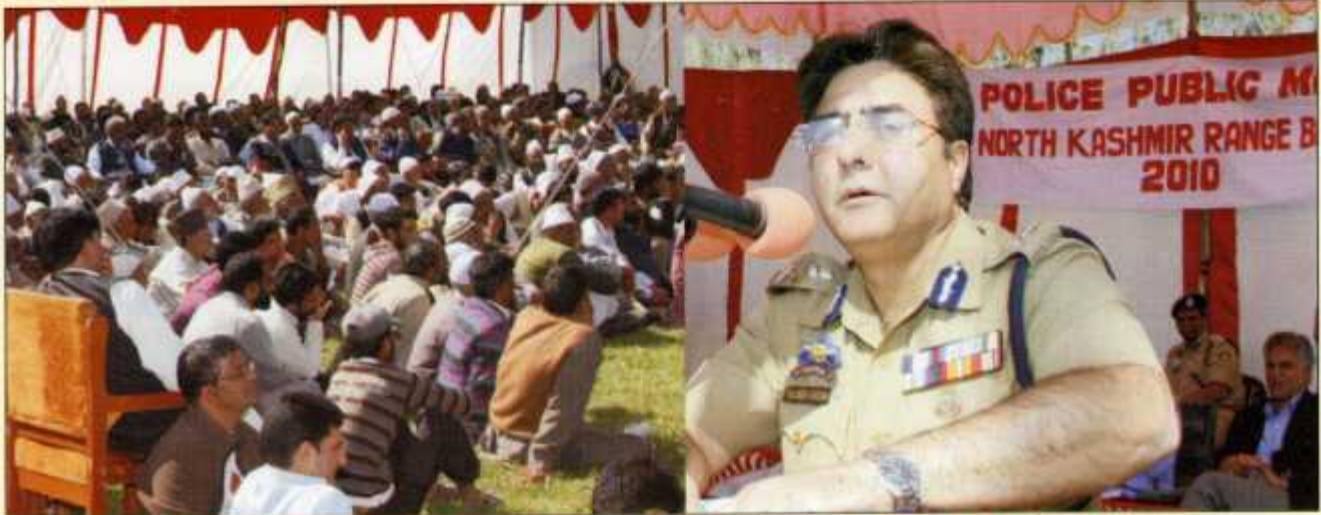
DGP J&K addressing the public during a police-public meet held at Baramulla on October 14, 2010