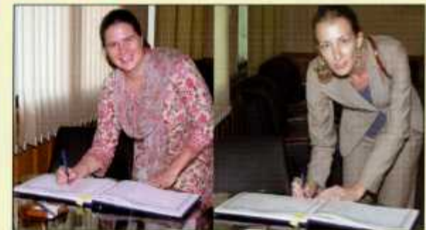
Below: British High Commission delegates putting down their visit notes in the Visitors book at PHQ J&K Srinagar on October 18, 2010