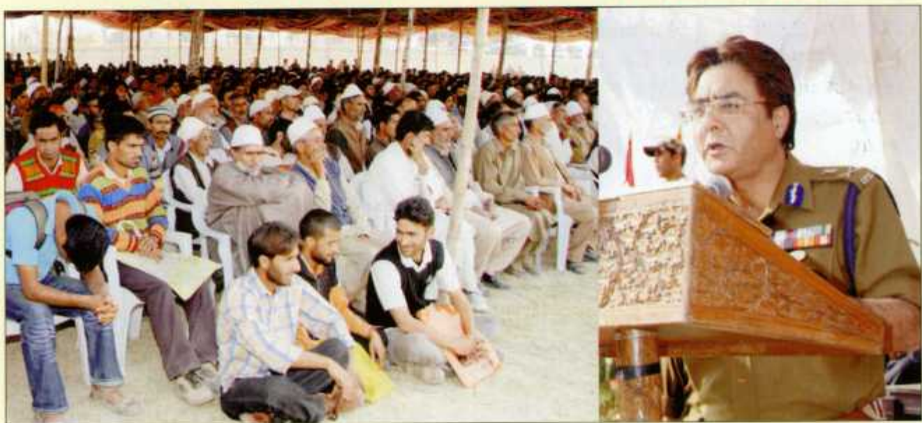
DGP J&K addressing the public during a police-public meet held at Budgam on October 20, 2010