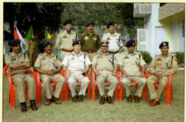
A group photograph of the Senior Police Officers clicked during the function