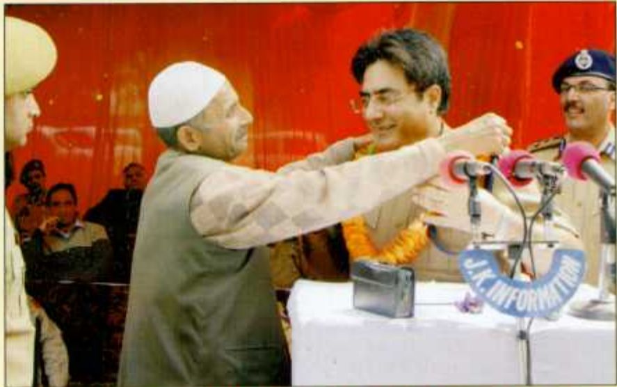
A civilian garlanding DGP J&K Shri Kuldeep Khoda IPS during a police public durbar held at Anantnag on October 11, 2010

The DGP appealed the respectables to guide the misguided youths so that their services are utilized for the development of the state. Lauding the role of public in times of peace and war, the DGP said that despite