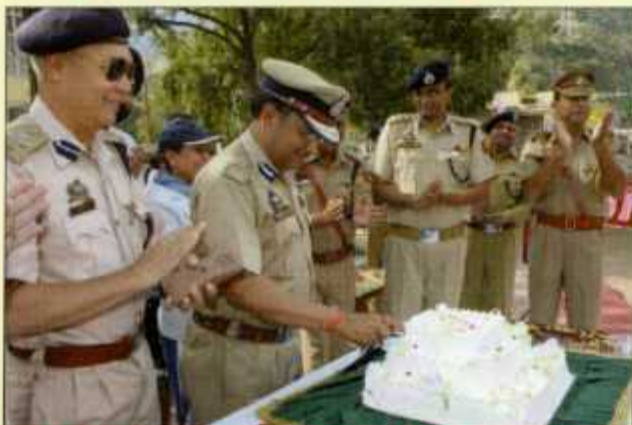
Shri Ravinder Kotwal IPS IGP Armed/IR Jammu accompanied by senior police officers inaugurating the 8th Raising Day function of IRP 9th Bn. by cutting a colourful cake