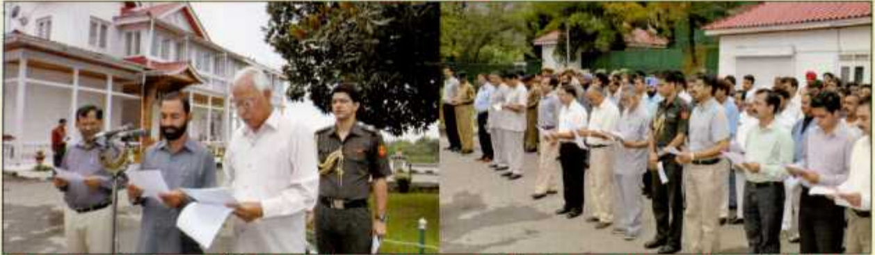
His Excellency the Governor J&K Shri N.N Vohra and Raj Bhavan staff including security personnel from J&K Police and BSF deployed at Raj Bhavan during Sadbhavana Day pledge at Raj Bhavan Srinagar on September 20, 2010