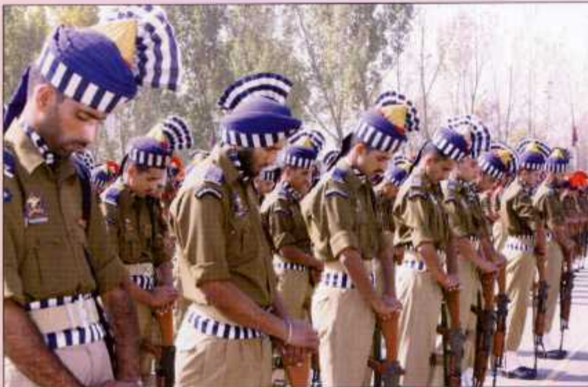
Observing silence to commemorate the memories of Martyrs' during Police Commemoration Day 2010 at Zewan Srinagar

Highlighting the sacrifices made by the police force in the State and elsewhere during the times of law and order situation and militancy, the Chief Minister urged them to