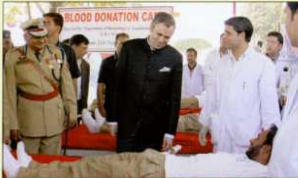
Hon'ble Chief Minister J&K Jenab Omar Abdullah accompanied by Shri K.Rajendra Kumar IPS ADGP Armed/Law & Order J&K at Blood donation camp during Police Commemoration Day 2010

"I take this solemn pledge that I will work for the emotional oneness and harmony of all the people of India regardless of caste, region or language. I further pledge that I shall resolve all differences among us through dialogue and constitutional means without resorting to violence".