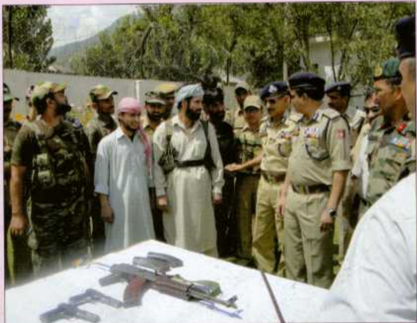
A view of Militants surrendering weapons before IGP Jammu Shri Ashok Gupta IPS at Doda.

During the month of October 2010, J&K Police eliminated 13 hardcore militants, apprehended 09 militants besides effecting recovery of a huge quantity of arms and ammunition during various encounters/search operations across the State. The recovered arms and ammunition include 16 AK Rifles, 44 AK Magazines, 1094 AK Rounds, 08 Pistols, 03 Pistol magazines, 05 Pistol rounds, 500 gms RDX powder, 04 RPG shell,s, 02 Binoculars, 40 KG Explosive, 04 RPG shells, 03 UBGL rounds, 09 UBGL shells, 02 Battery chargers, 01 Insas Rifle, 01 GPS, 01 Carbine, 01 Carbine Magazine, 02 Identity Cards, 01 I-Com set, 01 Antena, 05 Pouches, 02 Detonators, 01 Thoriya Phone, 11 Gelatin Sticks, 01 IED Box, one 8" Tube holder, 01 Cutter, 02 Radio Set Antenas, 13 Meters Fuse wire, 475 Pika Rounds, 05 Pika Belts, 02 Pika Guns, 04 Cell Phones with SIMs, 120 Feets Flexible Wire, 04 AGL Shells, 01 Pika Gun Booster, 02 IED Circuit Box, 10 Pencil Cells, 02 Telephone Batteries and 01 Pressure Cooker with Fitted Fuse.