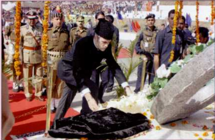
Hon'ble Chief Minister J&K Jenab Omar Abdullah laying the floral wreath at Police Martyrs Memorial at APC Zewan Srinagar on Police Commemoration Day 2010

Hon'ble Chief Minister J&K, Shri Omar Abdullah during the address lauded the role of J&K Police in combating militancy and maintaining law and order in the state. The Hon'ble Chief Minister said that the past 20 years have been the years of challenge for JKP personnel. "Concentrations on curbing militancy during these years has put normal policing at back burner" the Hon'ble CM said. He emphasized the need for rejuvenating the basic unit of Station House Officer to its prime importance.